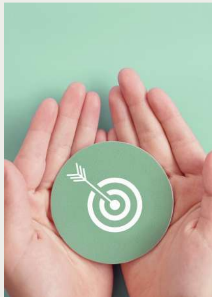
Accredited Excellence reflecting our high standards