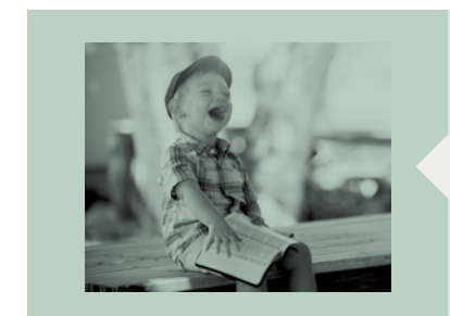
tailor learning to your professional interests