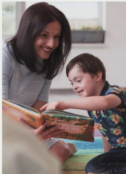
Flexible & Future-Focused opportunities for the future

The Master of Teaching (Early Childhood Education) (MTeach(ECE)) prepares graduates to make a meaningful contribution to the lives of children from birth to age five across a wide range of early childhood settings. This course opens the door to careers as early childhood educators, kindergarten teachers, and educational leaders who are equipped to shape the future of young learners.