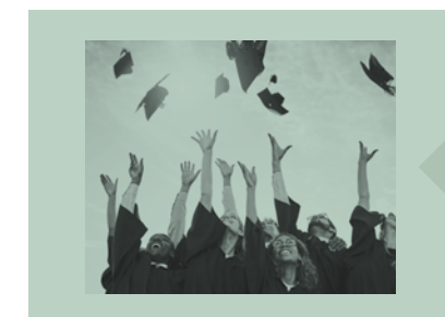
graduate with a highly regarded MTeach(ECE)

A key feature of the MTeach(ECE) is its nested structure. The first year of the MTeach(ECE) is fully aligned with the Graduate Diploma of Early Childhood Education (GDECE), giving students the flexibility to complete the GDECE as an exit qualification or continue into the second year to complete the full MTeach(ECE).