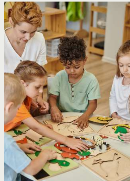
Career-Ready Learning equipping you with a wide range of skills

We prepare graduates to become educational leaders who are equipped to shape the future of young learners.