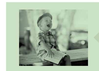
tailor learning to your professional interests